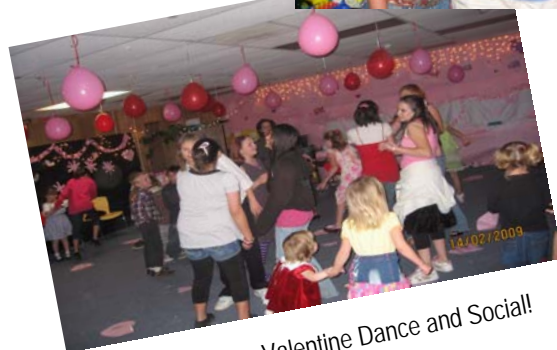
Fun times at the Valentine Dance and Social!